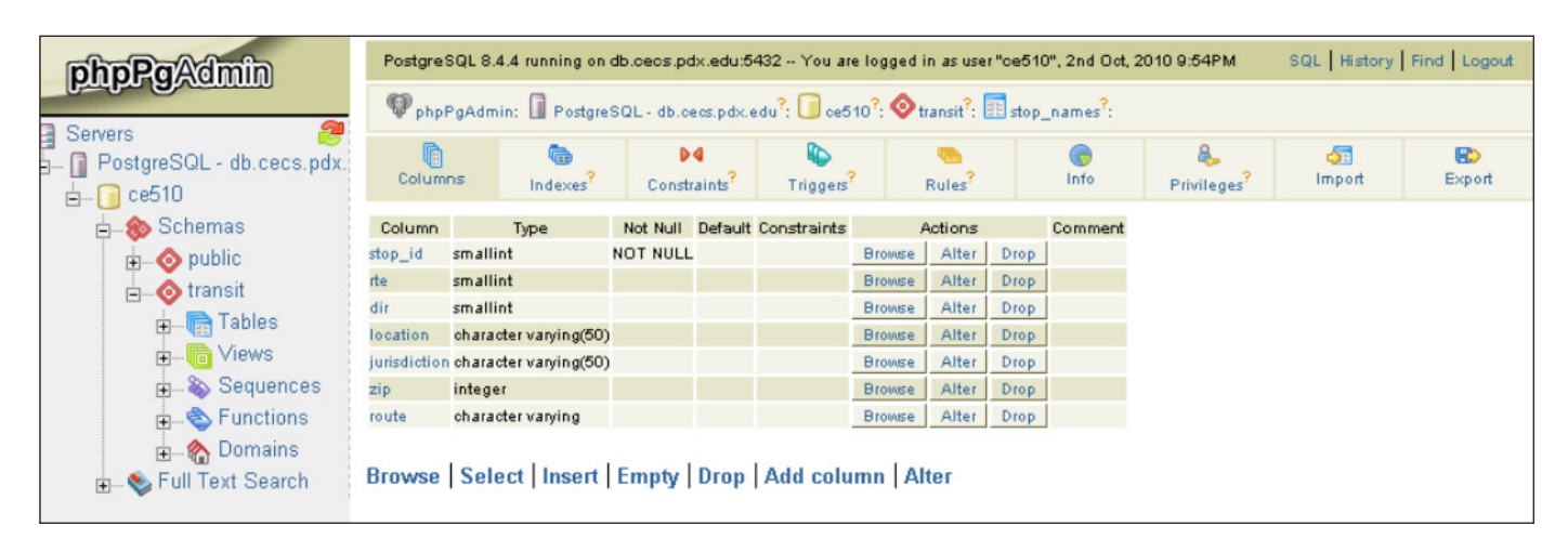
Figure 9 Screen Capture of the phpPgAdmin add table screen