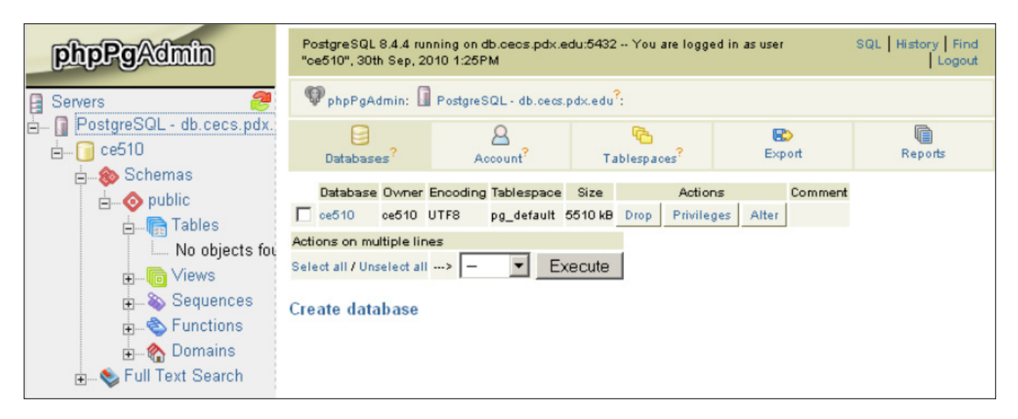
Figure 7 Screen capture of the phpPgAdmin login screen.

This interface allows you to do some point/click navigating of the PostgreSQL database. You can also issue commands directly with the SQL interface. Spend a few minutes navigating this interface. When you are comfortable clicking around the software, let's get started.